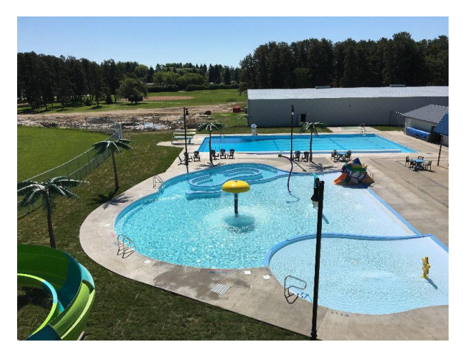
Figure 3: Transcona Pool (Winnipeg)