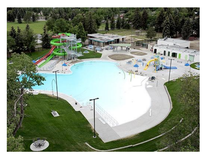
Figure 1: Henderson Lake Pool (Lethbridge)

The following images illustrate some of the recent outdoor pools built in western Canada. Figure 1, a photo of Henderson Lake Pool in Lethbridge, illustrates a pool that provides lap swimming, zero depth entry, spray toys and water slides. Figure 2 illustrates Irene Manley Pool in Nipawin, which offers separate lap swimming, zero depth entry, lazy river, spray toys and waterslide. Figure 3 illustrates Transcona Pool in Winnipeg, which provides lap swimming, zero depth entry, spray toys and water slides.